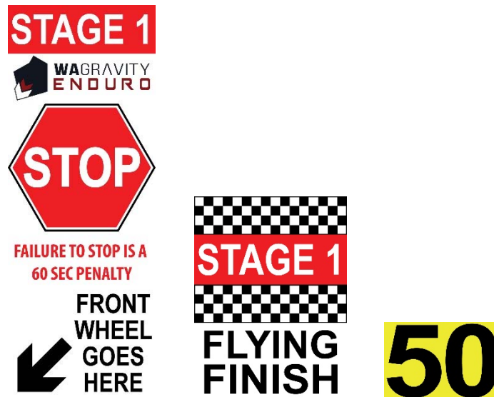
Typical Course Signage

If a competitor alters course signage without explicit approval from a Marshal or Race Director, the penalty is disqualification.