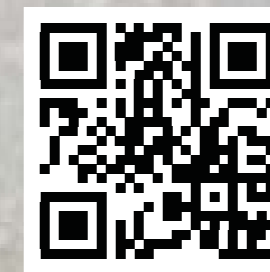
VIEW COURSE MAP ONLINE